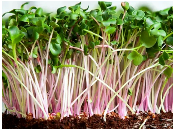
A fully certified organic and non-GMO variety

Nutritional Value: Sprouting seeds are richer in protein, folate, magnesium, phosphorus, manganese and vitamins C and K than un-sprouted plants. The vitamin and mineral content varies based on the variety of the sprouting seeds. Sprouts offer a powerful source of vitamins, minerals, antioxidants, and enzymes that fight free radicals because sprouting can increase their potency by 20 times or more.